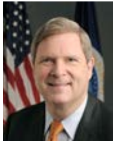
Hon. Tom Vilsack