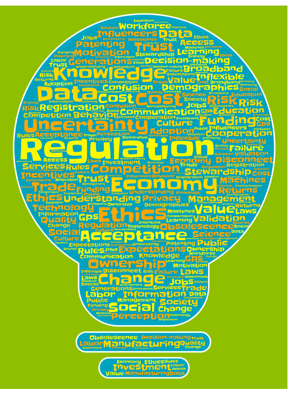
Challenges identified by individual participants during the FFAR convening event.