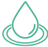
Sustainable Water Management