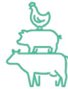
Advanced Animal Systems